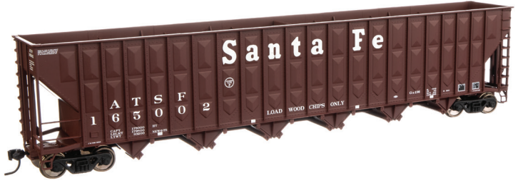
Santa Fe 910-6751 #165002