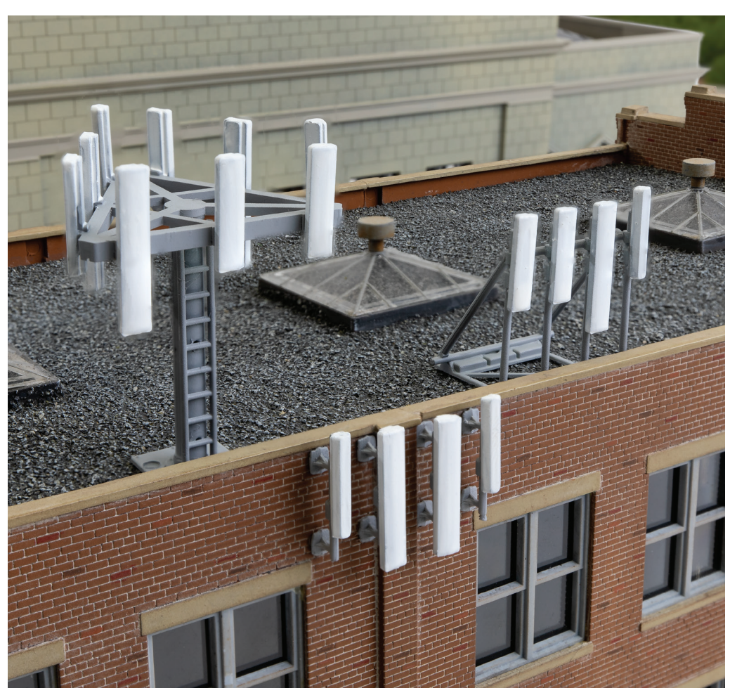
Figures, vehicles, and scenery items not included.

Mounted Communication Antennas Array Kit 949-4195