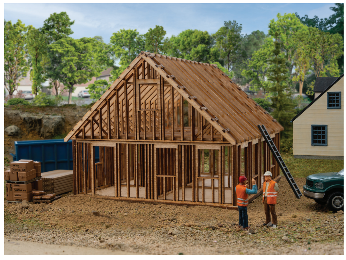
Figures, vehicles, railroad equipment, and scenery items not included.

Measures: 3-13/32 x 4-13/32 x 2-25/32" 8.6 x 11.1 x 7cm