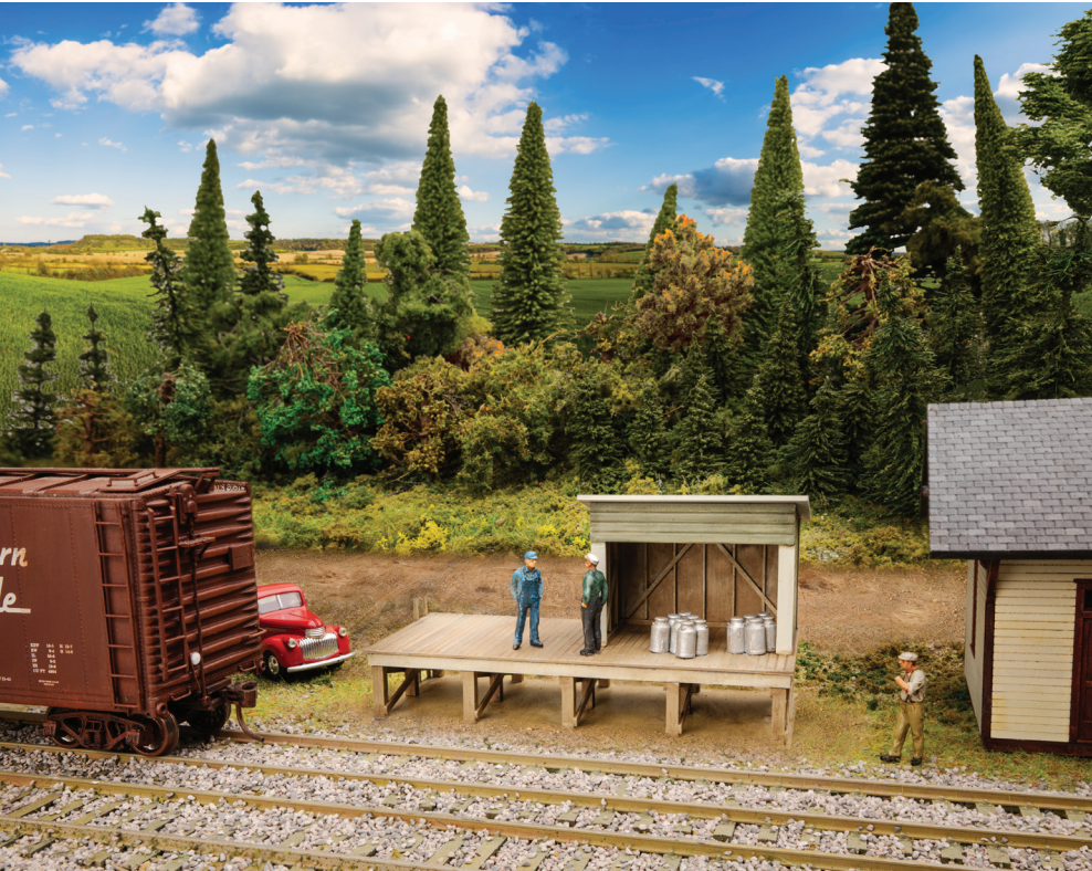
Figures, vehicles, railroad equipment, and scenery items not included.