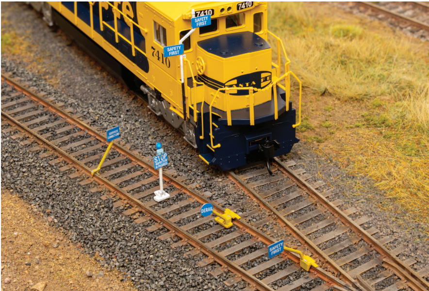
Yard Details - Blue Flag Kit 933-4162