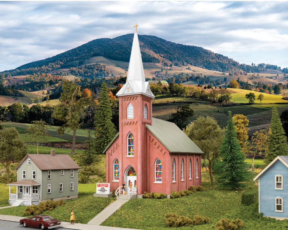
Brick Church Kit 933-3858 Measures: -4-7/8 x 2-3/4" x 6-7/16" 12.38 x 6.99 x 16.35cm

Figures, vehicles, railroad equipment, and scenery items not included.