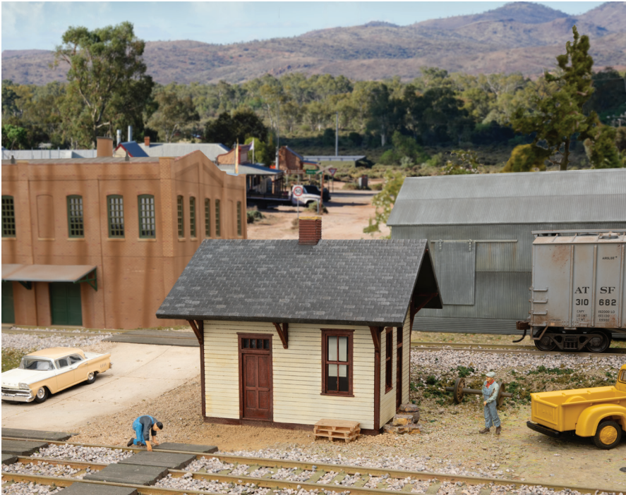
Figures, vehicles, railroad equipment, and scenery items not included.

Flag Stop Station Kit 933-4061 Measures: 3-3/8 x 3-1/16 x 2-7/8" 8.57 x 7.78 x 7.30cm